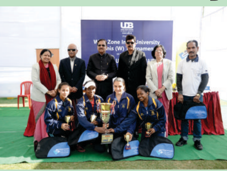
Mumbai University , Winners of the West Zone Tennis Tournament

Mumbai University won West Zone Tennis Tournament over Pune University with 2-0.