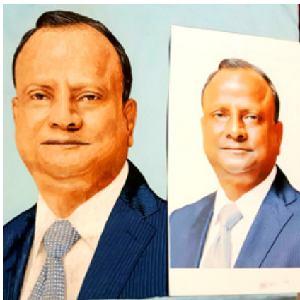
fp= 1 q; k11] Q; fDr fp=