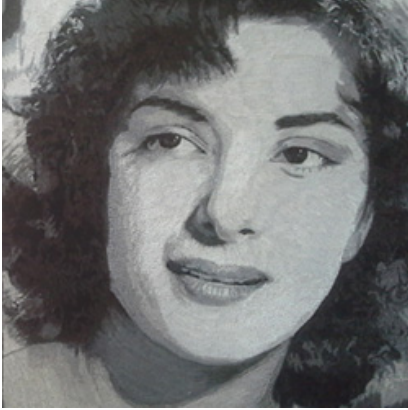
fp= l 4 ; k13] Q fDr fp=