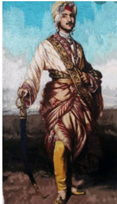
fp= l ą ; k20] E l g j k t k H i n z l g