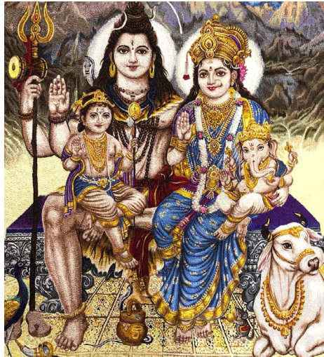
fp= l ǻ ; k24] f' lo i fjolj