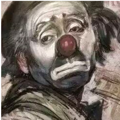
fp= l 4 ; k16] mnkl t klj