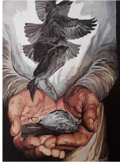
fp= l ǻ ; k22] l ǻ kt u