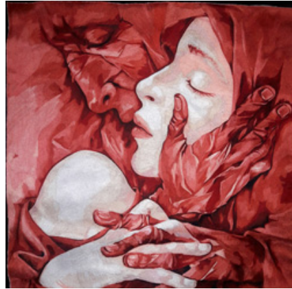
fp= l ą ; k18] l ą k u