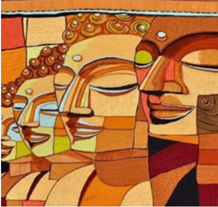
fp= l ǻ ; k21] l ǻ kt u