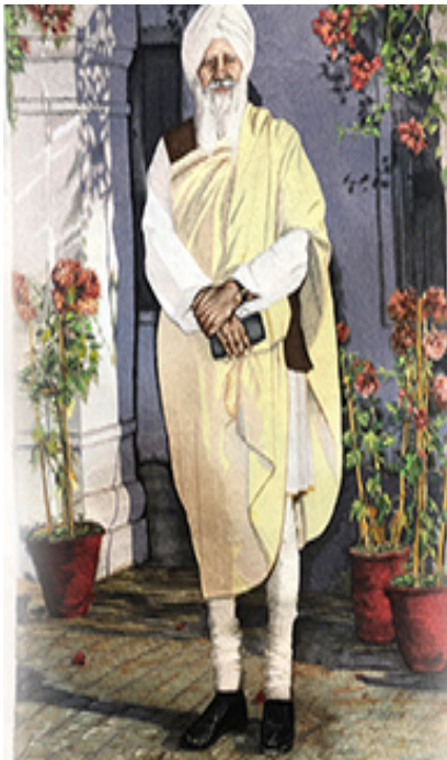
fp= l ą ; k19] j k k l o k e h e g j k t