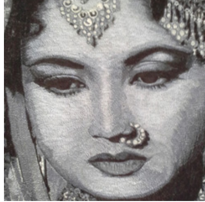
fp= l 4 ; k14] Q fDr fp=