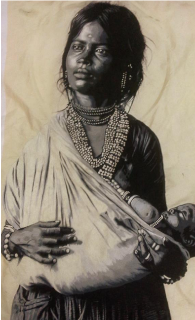
fp= l ǻ ; k23] xjlc ybdh