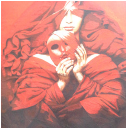
fp= l ą ; k17] eł kłs