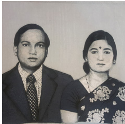
fp= 1 q; k12] Q; fDr fp=