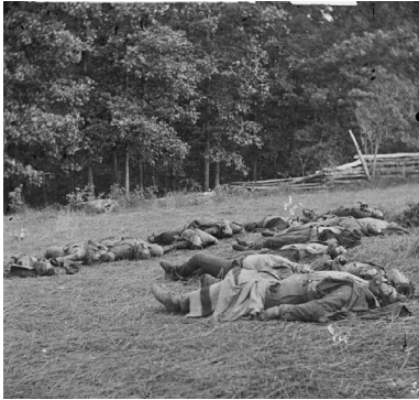
Fig. 6 : Timothy H. O'Sullivan, Gettysburg, Pa. Confederate Dead Gathered for Burial at the Southwestern Edge of the Rose Woods, July 5, 1863 . Library of Congress.

tain. Again, we have the general experience communicated via the specific. This technique is also emphasized by the cut to the next photograph, showing Confederate dead gathered for burial (Fig. 6).