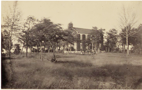
Fig. 1 : Andrew J. Russell, General Beauregard's Headquarters at First Battle of Bull Run, 1861. Library of Congress