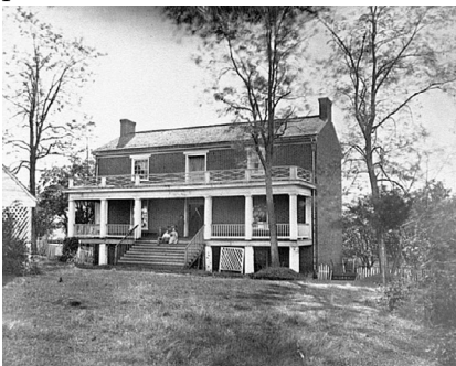
Fig. 3: Timothy H. O'Sullivan, Appomattox Court House, Va. McLean House, 1865 April . Library of Congress.

In another hallmark of photographic histories of the American Civil War, Francis Trevelyan Miller's The Photographic History of the Civil War in Ten Volumes (Vol. 3, 1911), we find a very similar picture of Appomattox Court House, also by Timothy H. O'Sullivan (Fig. 3). It is preceded by the view of McLean's House at Bull Run (Fig. 1), just as in the opening scene of Ken Burns's The Civil War . The two photographs are arranged on two pages facing each other, and they are accompanied by a commentary entitled 'The Homes of Wilmer McLean Where the Battles Began and Ended' (3:314–15). Miller points out the coincidence of these two historic houses belonging to the same man and tells the story of McLean moving to another location for reasons of safety. However, the house near Manassas Station is primarily connected to General Beauregard, who chose it as his headquarters. In Miller's narrative, it is the general's dinner rather than the McLeans' house that was spoiled by a cannonball landing in the fireplace.