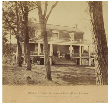
Fig. 2 : McLean's House, Appomattox Court-House, Virginia Where the Capitulation Was Signed between Generals Grant and Lee, 1865 April, c1866.