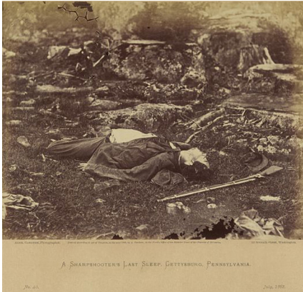
Fig. 7 : Alexander Gardner, A Sharpshooter's Last Sleep , Gettysburg, Pennsylvania, July 1863, c1866.

Gardner, Miller, and subsequently Burns, stress the individual tragedy of the dying soldier and the sorrow of the families at home. This finds prominent expression in their usage of a by now iconic photograph of a dead sharpshooter. It is a Gardner photograph called in the Sketch Book "A Sharpshooter's Last Sleep" (Plate 40, 88, Fig. 7). In the Sketch Book it precedes "Home of a Rebel Sharpshooter". Its letter-press concentrates