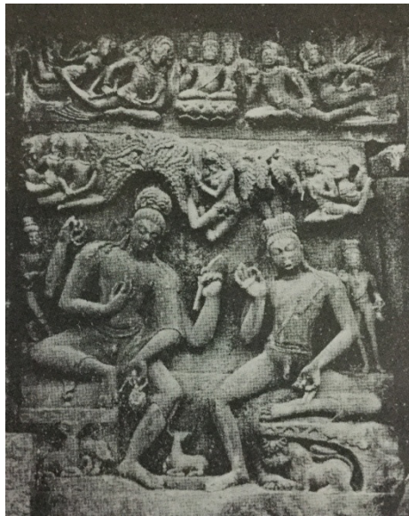
Fig. 4(d) : Naranarayana, Deogarh

Fig:4(d) In the panel from Deogarh representing Naranaarayana, where Vishnu, in the guise of sage, is expounding the highest truth, the atmosphere of the tapovanam is vividly presented by snake, the deadliest receptacle and harmless pair of deer, and also by the tiger, with terrible teeth, ordinarily a great source of fear but can't here excite any. So it's creating the beauty of this panel.