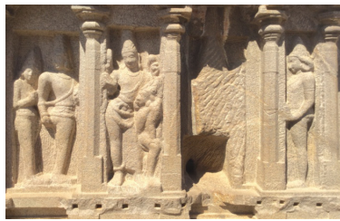
Fig. 4(a) : Northern side

In central niches on the northern side a male figure is shown with attendant. The male figure has four hands. Niches on the left includes a couple. (Fig: 4a)