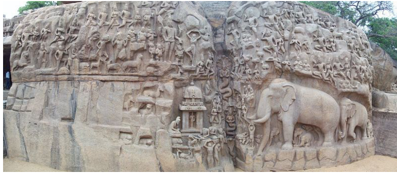
Fig. 1 : Arjuna's penance

only its external shape, size, color and structure. To know the object in deep detail, with our five senses and mind.