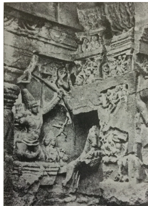
Fig. 3(b) : Tripurantaka- Ellora Caves

Fig:3(b) Siva is fighter. In the chariot which is the earth on wheels composed of sun and moon, the horses yoked to biting the vedas controlled by charioteer who is Brahma himself. In the hand of Siva is the mighty bow pinaka, composed of huge mountain meru with vasuki as the bowstring, the arrow being Vishnu himself. With this formidable equipment Siva is presenting as the victor of Tripura, the Asura who were a menace to the world.