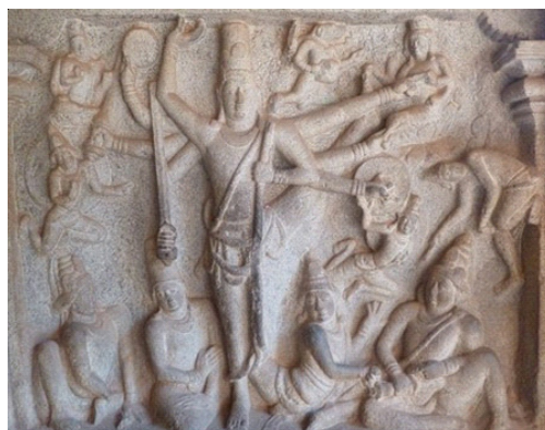
Fig. 2(a) : Thiruvikrama

Fig.2(b) , The sculpture representing Siva and Gangadhara, representation of a mermaid like figure for the river. The three streams of Ganga, as she flows in heaven, on earth and in the nether world , here lord Siva is shown Gigantic in size at the same time Parvati also represent equal importance and rest of the figures in smaller size sculptures in this panel. Siva is standing Thribanga pose.