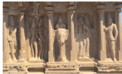
Fig. 4(b) : Eastern side