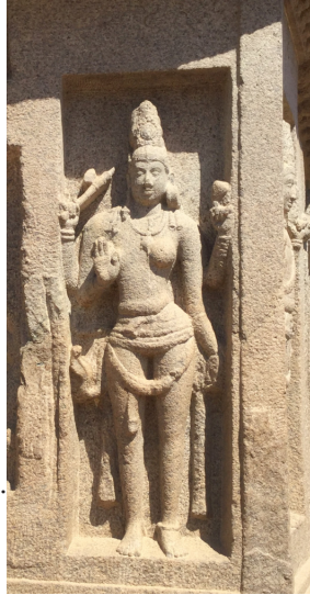
Fig. 5 : Ardhanari