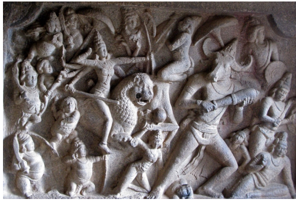
Fig. 3(a) : Mahisasuramardini

waiting for the opportunity moment. It seems an uneven battle with the slender diminutive goddess playfully shooting her arrows over the mahisan's head and not even looking at him as she advances with drawn sword and other weapons in her eight arms. Solely the intensiveness of her mount and also the assured attitude of her attendants, who.e the demon's followers cringe and flee indicate the outcome of the battle. With discreet restraint the artist shows the superiority of the courage and trust in higher power as she looks upwards, over cunning and brute strength.