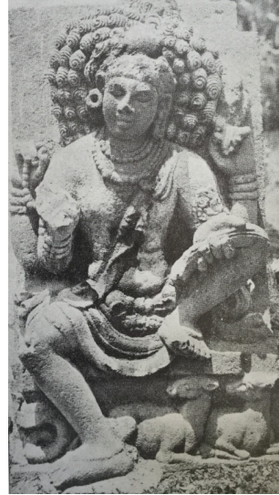
Fig. 5(b) : Dakshinamurti

If the lord Shiva is sculpted it should be look like Shiva not human or other. The sculptures of the Dharma-ratha at Mahabalipuram, the shrine walls are decorated good illustrations.