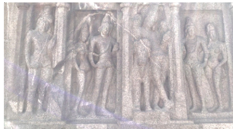
Fig. 4(c) : Southern side

In central niches on the eastern side shows a male rider over an elephant. Two ladies are found on adjacent niches, while a bearded man and child is shown on another niches, The ladies are have praised for their beauty and charm by visitors alike. One dvarapala holding bow and bearing a thread made of human skull while the other is standing with on the thigh and another hand raised in adoration. (Fig: 4b)