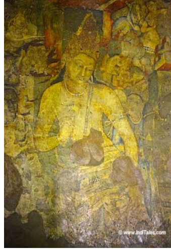
Fig. 6(a): Devi, Pallav, Panamalai Fig. 6(b): Padmapani - Ajanta

In the structural Pallava temples at panamalai and Kanchipuram there are other fragments which give us a glimpse of the development of painting a few decades later.